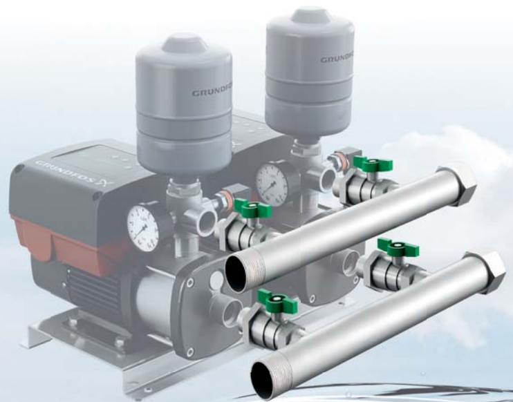
Inlet/Outlet Pipe kit for CMBE TWIN

Inlet/Outlet Pipe kits are available for the CMBE TWIN booster for easy installation of an Inlet/Outlet pipe. The pipe kits include ball valve and unions and 1½" outlet connection.